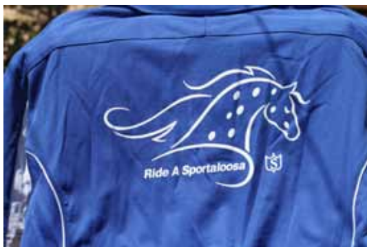
Polos - assorted sizes in blue, black, red, green, pink $40 (inc postage in Australia & NZ)