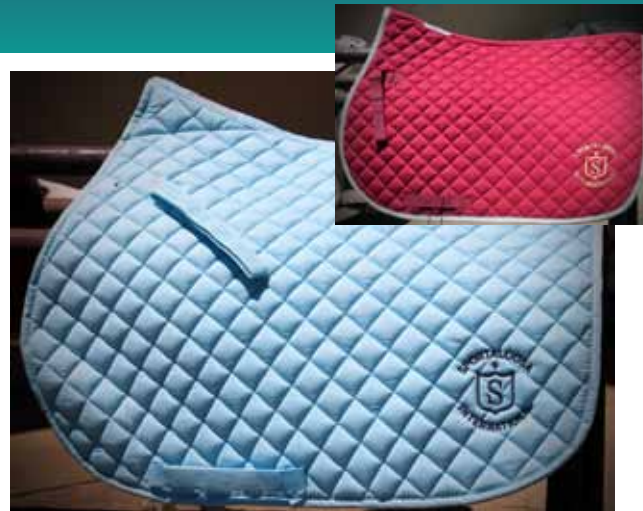
All rounder saddle cloths - 2 available $45 (inc postage in Australia)