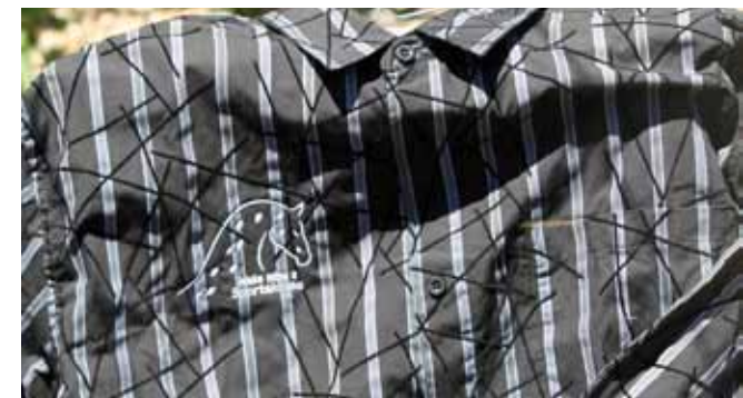
Assorted men's shirts $40 (inc postage in Australia)

Email samantha@sportaloosa.com to check on your desired colour and size of these limited edition, hard wearing and comfortable items.