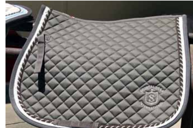
Full size dressage saddle cloths $60 (inc postage in Australia)