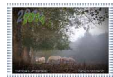
2014 calendar $20 (inc postage in Australia)

Email samantha@sportaloosa.com to check on your desired colour and size of these limited edition, hard wearing and comfortable items.