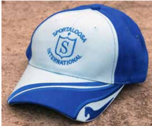
$30 (inc postage in Australia & NZ)